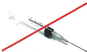
NO Needles (Keep medical waste out of recycling. Place in safe disposal containers like Waste Management's MedWaste Tracker® box.)

To Learn More Visit: RecycleOftenRecycleRight.com