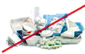
NO Foam Cups & Containers (Check Earth911.org for options.)