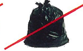
NO Bagged Recyclables