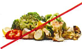
NO Food Waste (Compost instead!)