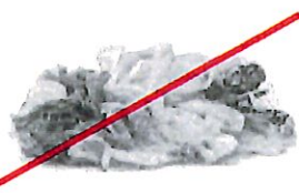
NO Plastic Bags & Film (Find a recycling site at plasticfilmrecycling.org)