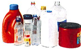
Plastic Bottles , Jars & Jugs (narrow neck) containers labeled #1 and #2